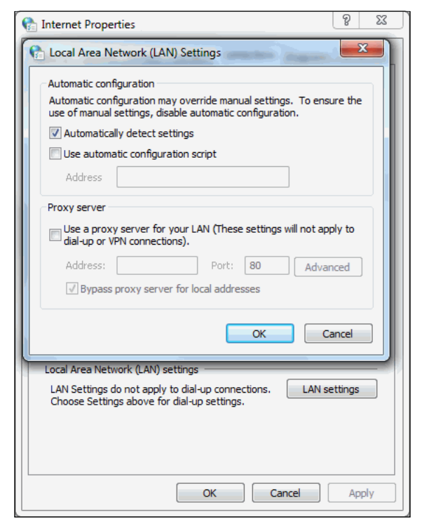
The Local Area Network (LAN) Settings screen.

The following options appear in the Local Area Network (LAN) Settings dialog box: